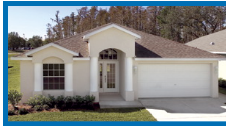
The Grandview built 2004 PBA Showcase Home.

The PBA's Showcase Home is an annual project dear to everyone in the Pasco Building Association. Each year, a home is built from the contributions of PBA members, area businesses, private donors and anyone else that can spare a yard of sod, a bucket of paint, a bag of nails or a handful of dollars.