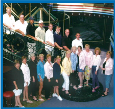
The Grandview employees that make it happen.