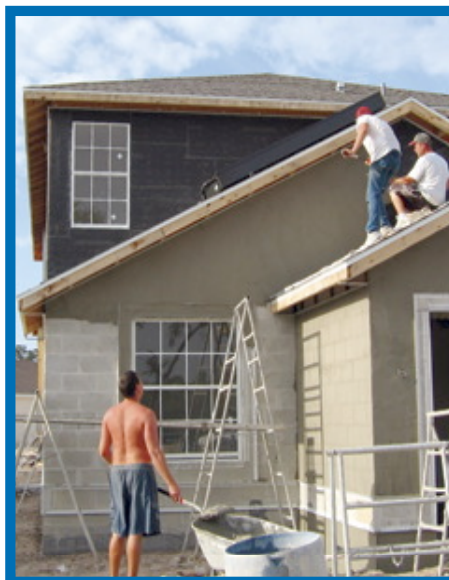
Another Grandview home goes up.

Pasco County is a great place to work and live, and the family knows that their commitment to quality homes in quality communities have helped their success. "I've seen so much change in the last five years, and on top of the last 30 years, Pasco County has changed dramatically. I think Pasco will continue to grow steadily for the next 10 years and will be a wonderful place for the next generation."